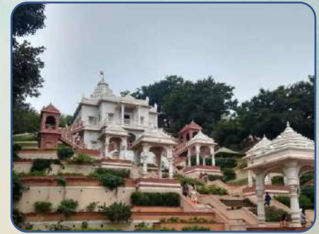
GAJANAN MAHARAJ MANDIR