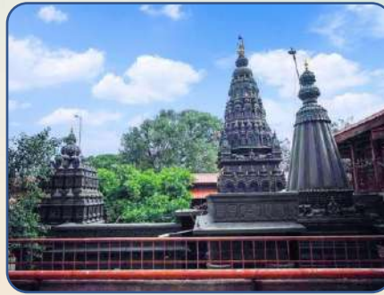
DNYANESHWAR MAHARAJ SAMADHI MANDIR