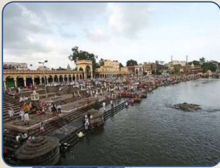
INDRAYANI RIVER BANK